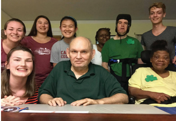
STUDENTS POSING FOR A PICTURE WITH L'ARCHE MOBILE RESIDENTS

We decided to bring our experiences and hope back from L'Arche in Mobile to Grand Rapids, Michigan. Our group considered the idea of starting Best Buddies (a local developmental disabilities chapter) here in our community. I pray to remember to treat everyone with love, knowing that we have all been fearfully and wonderfully made. I pray the sparks do not die, and I am excited for the light of hope to grow here in Grand Rapids. ▾