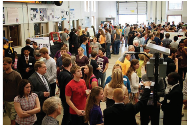
SENIOR DESIGN OPEN HOUSE

On an afternoon in May, the engineering building at Calvin College is crowded with people, from young to old, some in suits and some in casual clothes. If you go in closer, you will find that people in suits are presenting their ideas or products. People around them are listening and asking questions. This is the annual new product showcase of Calvin College from the senior engineering students. It shows the newest technology from the Calvin community.