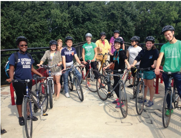
SLC STAFF ON A BIKE TOUR AROUND GRAND RAPIDS