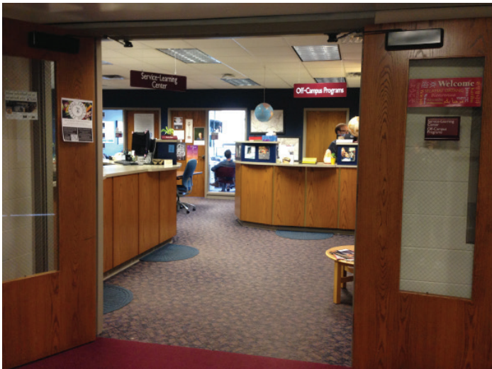
NEW OFFICE PLACE FOR THE SLC IN THE SPOELHOF CENTER