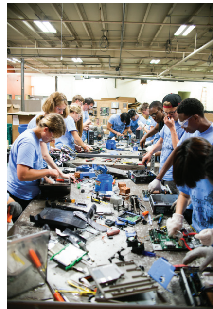
STREETFEST: STUDENTS TAKING APART COMPUTERS