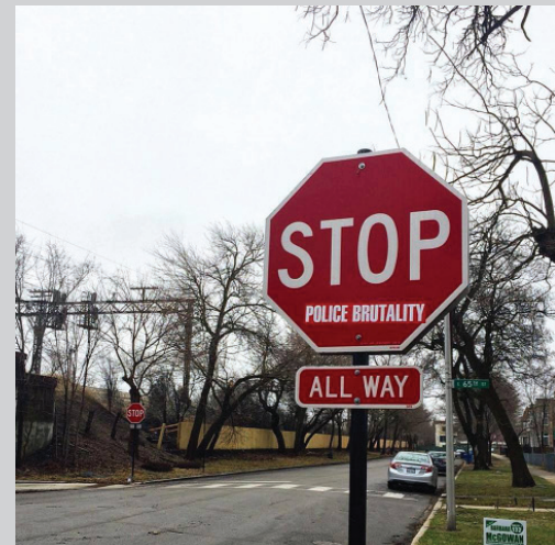
CHICAGO, ILLINOIS (INDIVIDUAL PHOTO CONTEST WINNER)