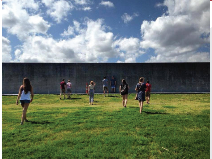
GRAND ISLE, LOUISIANA (GROUP PHOTO CONTEST WINNER)

"As part of our learning for our trip, we visited the exact location where the levy broke and flooded the entire Lower Ninth Ward during hurricane Katrina. Reflection on all of the pain and suffering felt by the people of this community paired with the realization of great injustices that are still faced caused a great humbling in each of our hearts."