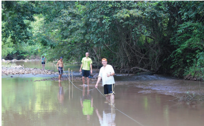
TEAM GATHERING DATA IN EL POTRERO

One of this year's projects is "Puente Con La Gente" which means "bridge with people" in Spanish. A team of four civil engineering students took on the task of designing a bridge for people in El Potrero, Honduras. They took a trip there from August 28 to September 2, 2015 to gather data for this project.