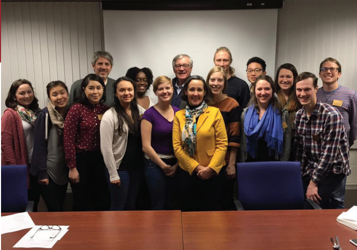
SLC STAFF WITH OUTGOING MAYOR GEORGE HEARTWELL