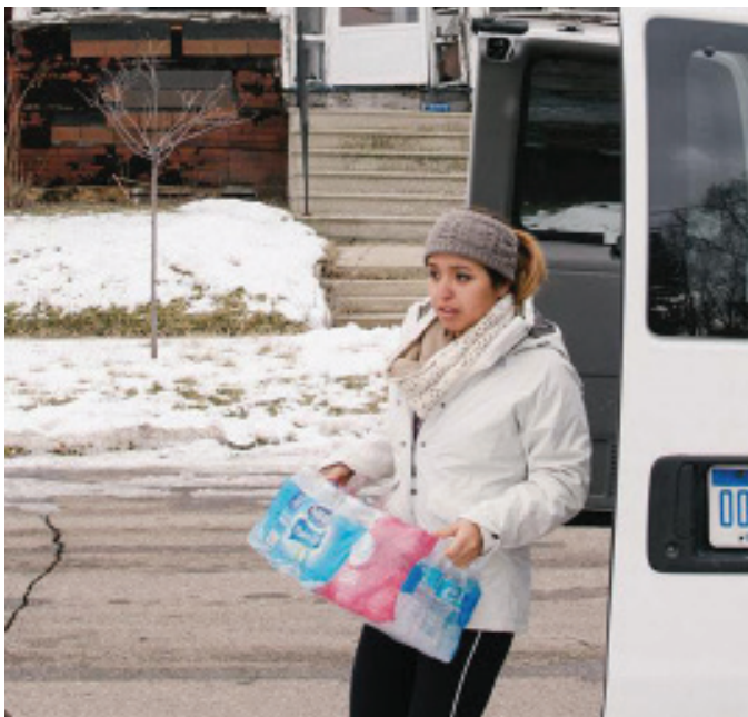
STUDENT UNLOADING WATER FROM THE VAN